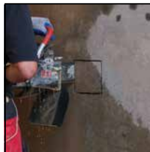
Cut squares as small as 4" x 4" (10 cm x 10 cm)