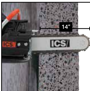
Deep cutting solution for obstructed or small openings

Extended drive sprocket adapter offers easy chain assembly