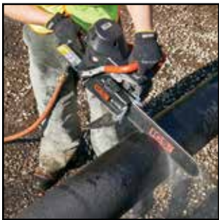
Cut up to a 10" (25cm) pipe from one side.