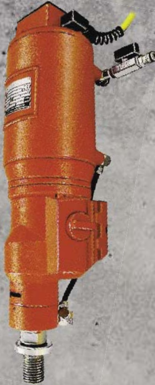
24" Bit Capacity