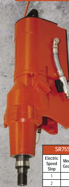
26" Bit Capacity