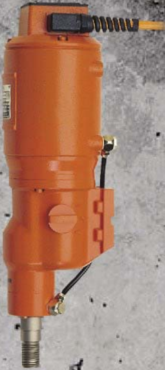
20" Bit Capacity